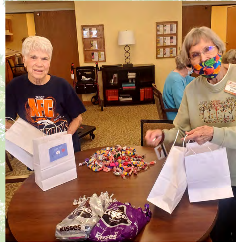
Someren Glen residents working together to create joy for others

In 2021, after CLC amassed more Personal Protective Equipment than was required, we met needs of other area non-profits by donating nearly $38,000 worth of surgical masks, disinfectant wipes, gowns, gloves, and shoe coverings. Organizations benefiting included Reel Recovery, a non-profit that conducts fly fishing retreats for men living with cancer, Denver Animal Shelter, and Soul Dog Animal Shelter.