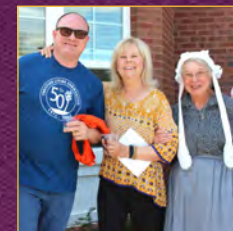
Celebrating our heritage at Clermont Park's Dutch Day and Founder's Festival