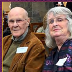
Residents enjoying the Holly Creek 50th Anniversary celebration