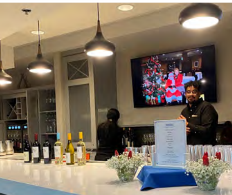
In 2021 we began renovation work funded by our 2019 bond refinancing. Top: the updated living room at Clermont Park Bottom: the new social hub in the living room at Holly Creek