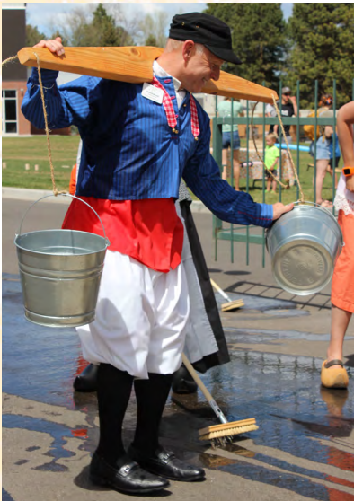
The traditional washing of the streets at Clermont Park's Dutch Day celebration 2022

The COVID-19 pandemic became “normal.” Pruning, strengthening, rebuilding, reflecting, and celebrating our hard work, resiliency, and caring for one another guided our efforts. Through thoughtful prayer and support from our Board of Directors, we reduced the number of communities we support to thirteen to strengthen our roots and reposition ourselves for new growth. 2021 was our “recharging” year.