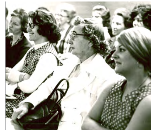
Top: A group of early residents at University Hills Christian Nursing Home Bottom: Some of the first team members