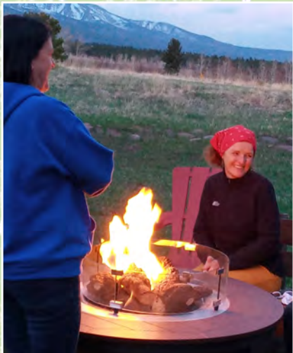
Team members and families relaxing at Historic Pines Ranch in Westcliffe, CO.

Thank you for your ongoing support, as it allows Christian Living Communities to continually live out our mission.