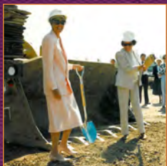
Bottom: Several of the original Board of Directors on opening day

We are jubilantly moving forward in our 50th year of service to older adults and their families, committed now, more than ever, to our vision, mission, and values founded by a dedicated group many years ago.