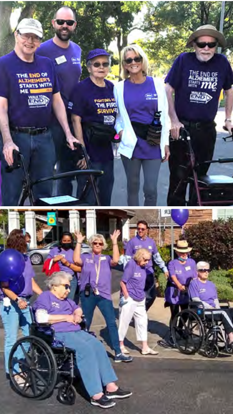
CLC supporting the Walk to End Alzheimer's! Top: Clermont Park residents at the Denver City Park walk Bottom: Holly Creek residents walk at the community

Christian Living Communities remains committed to serving the greater community by generously giving back. Whether it be residents who lovingly gather weekly to knit, sew, and crochet blankets, hats, and sweaters for babies in need, or residents and team members who don their walking shoes to raise money for the Alzheimer's Association, serving others is woven into our culture.