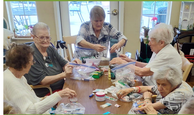
Cappella of Pueblo West residents preparing supply bags for the Pueblo Rescue Mission

Even a simple Ziplock bag can be a powerful act of kindness! The Cappella of Pueblo West community came together to assemble supply bags for the Pueblo Rescue Mission—showing that even the smallest gestures can make a meaningful difference.