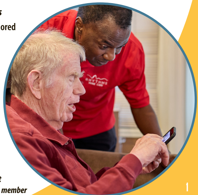
A Rhythms Home Care client sharing photos with a team member