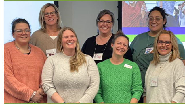
CLC welcomes new Eden Alternative educators

In 2024, more than $9,000 of donor gifts was invested in Eden Alternative Certification for 49 CLC Citizens, including eight remarkable residents. This training deepened relationships, enriched community culture, and reaffirmed our commitment to exceptional care and purposeful living.