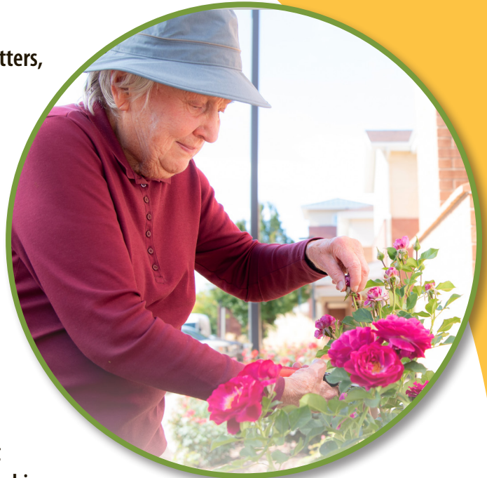
Enjoying tending to the roses at Clermont Park

Gratitude is central to health and wellness. We look for every opportunity to celebrate and say “thank you.” Our mission unites us.